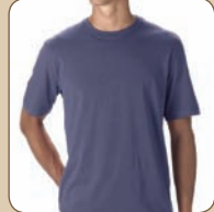
No collar. T-shirt style