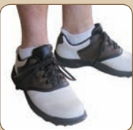
Visible ankle socks