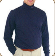
Golf style skivvy