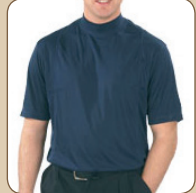
Collarless golf shirt