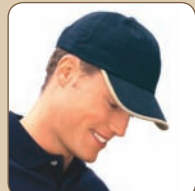
Cap (Not in clubhouse)