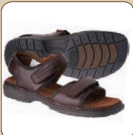
Sandals or Joggers