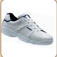
Sport golf shoe