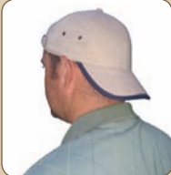
Cap back to front